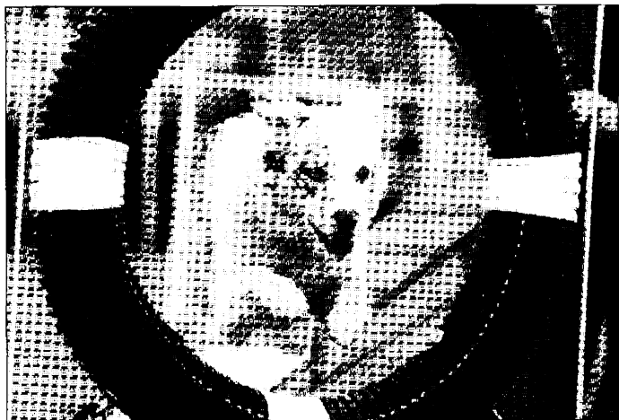
Figure 3. Cayenne Pepper leaping through the tire obstacle.