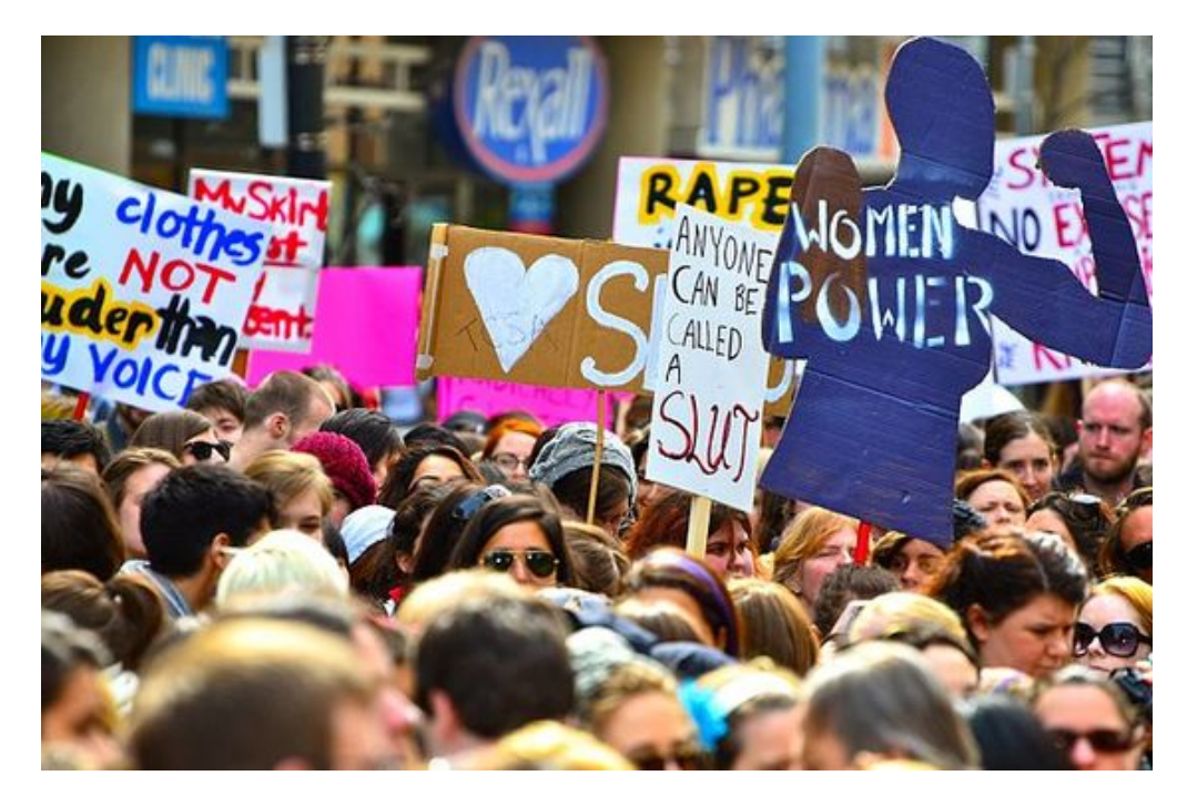
The first SlutWalk, an international protest against rape culture, in Toronto, 2011.