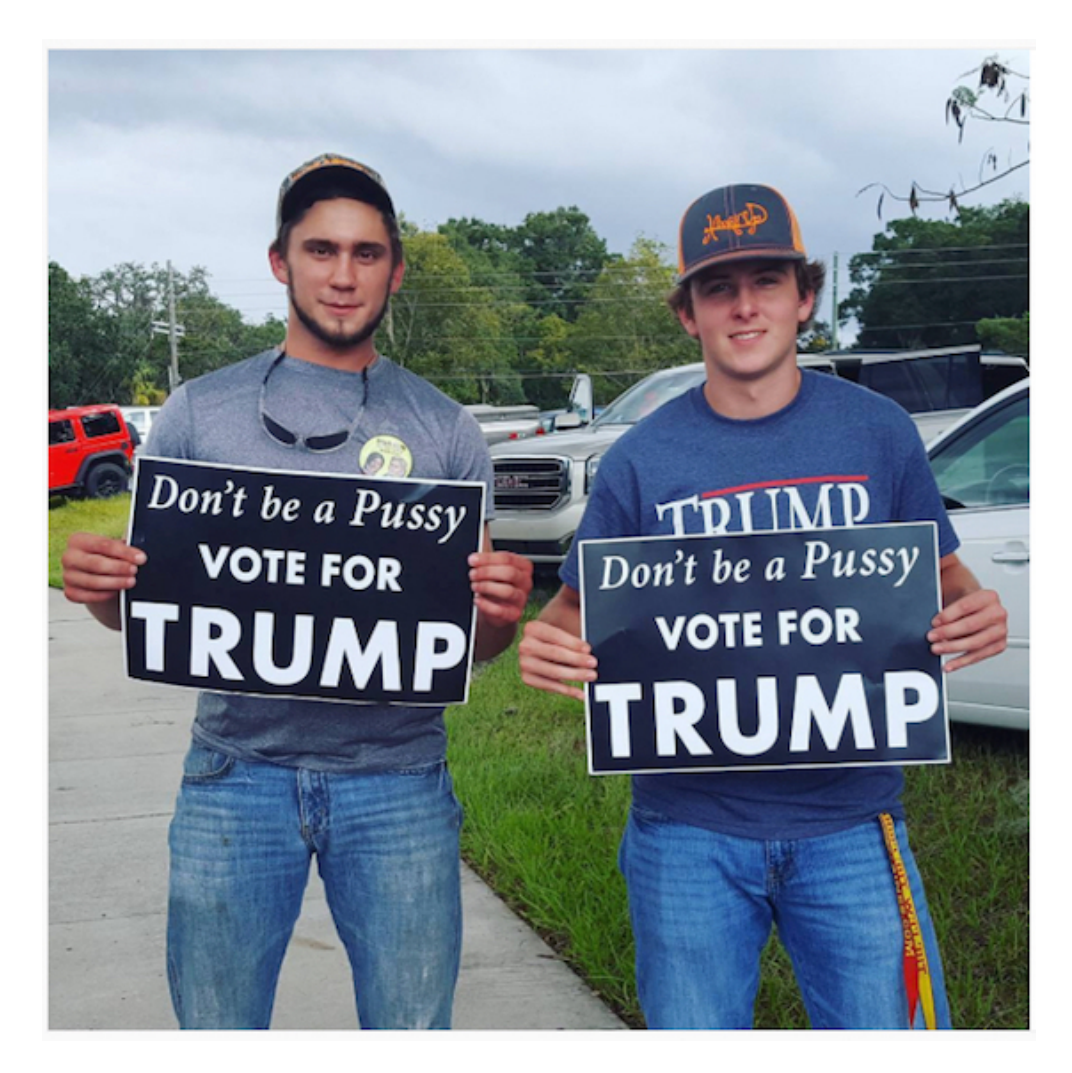
Florida supporters of Donald Trump, 2016.