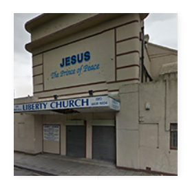
ESSAYS & REVIEWS

In a real, material sense, capitalism doesn't produce goods nearly so much as it produces trash.