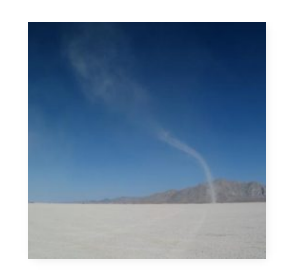
ESSAYS & REVIEWS

London's discarded lots become holy ground